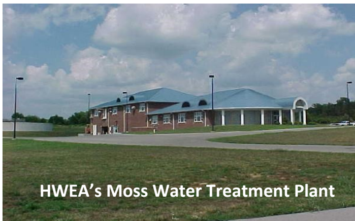
HWEA's Moss Water Treatment Plant

HWEA produces an average of 6.74 million gallons per day of drinking water for the City of Hopkinsville and Christian County. The peak demand for water was 8.6 million gallons per day.